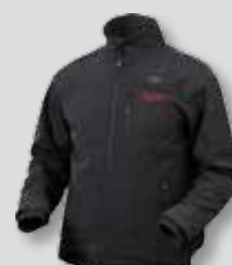
Black (2344, 2345)