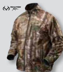
Realtree Xtra® Camouflage (2342, 2343)