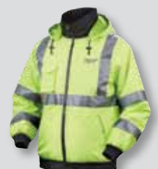
High Visibility (2346, 2347)