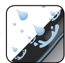
Water and Wind Resistant