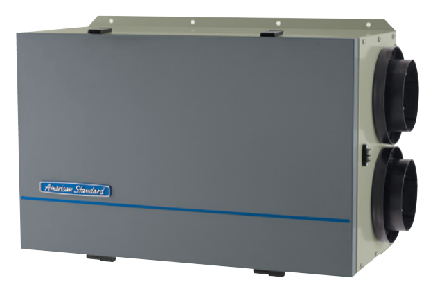
EERVR100, EERVR200, EERVR300

American Standard® ERV boasts quiet operation and an industry-leading warranty.