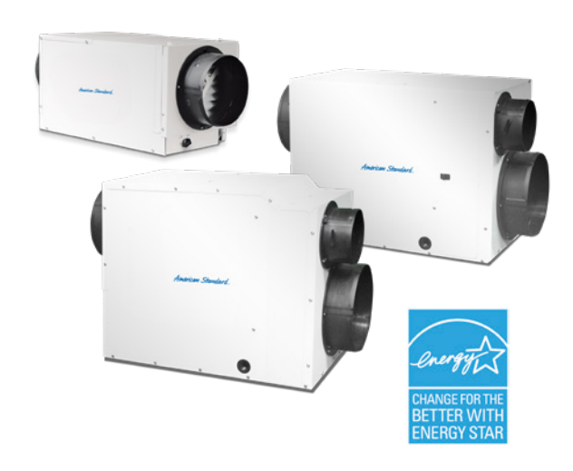
EDHUM70HAH1MNBA, EDHUM098AH1MNBA, EDHUM120AH1MNAA