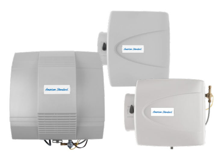
EHUMD500, EHUMD300, EHUMD200