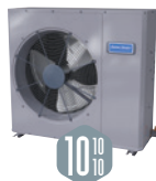
PLATINUM 19 4A6L9 Up to 19.0 SEER2/9.0 HSPF2†